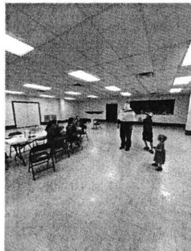
4 Last 4-H Meeting for the 22-23 Year