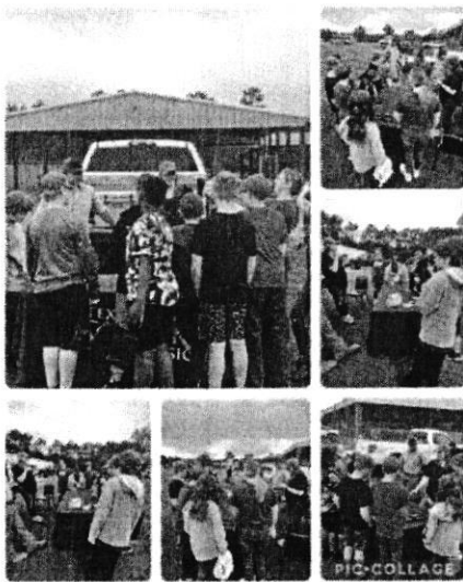
Figure 3 Sabine and San Augustine County 6th Grade Forestry Tour

Educational programs of the Texas A&M AgriLife Extension Service are open to all people without regard to race, color, religion, sex, national origin, age, disability, genetic information, or veteran status